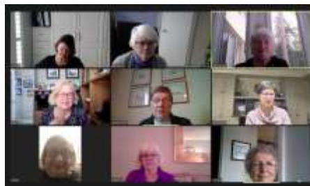
December Video Meeting of Reading Group